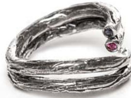
TLSSBSR Sterling silver adjustable, stackable branch ring with 1.8mm blue sapphires $32