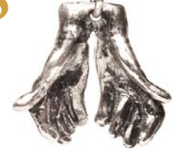
ECSSHN Sterling silver hands 17" necklace (+1" ext) $38