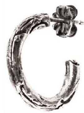
TLSSSE Sterling silver small branch earrings (apx 0.7") $24