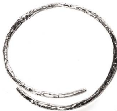
TLSSBG Sterling silver adjustable, stackable branch bangle $120