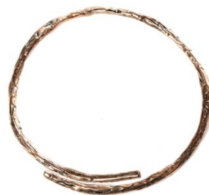
TLBRBG Bronze adjustable, stackable branch bangle $60