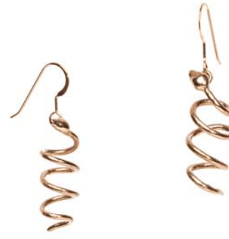
ECBRDE Bronze snake earrings (apx 1.5") $32