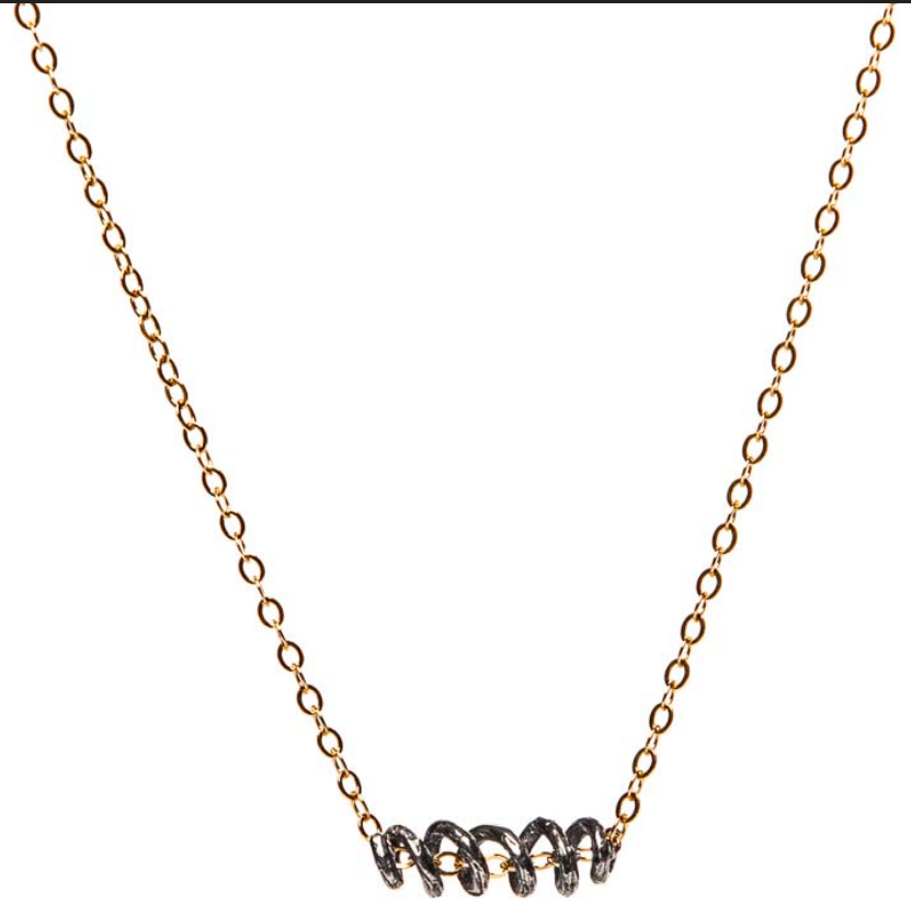
TLSSGFN Sterling silver wrap on 17" gold filled chain necklace $40