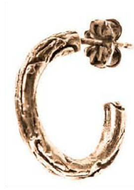
TLBRSE Bronze small branch earrings (apx 0.7") $18