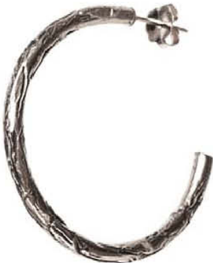
TLSSME Sterling silver medium branch earrings (apx 1.2") $44