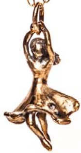
ECBREN Bronze dancing Eve on 17" gold filled chain necklace (+1" ext) $32