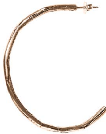
TLBRXLE Bronze XL branch earrings (apx 1.8") $34