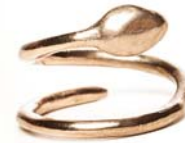
ECBRAR Bronze adjustable snake ring $18