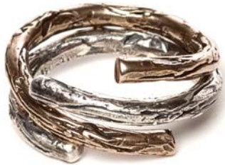
TLBRTR Bronze adjustable, stackable branch ring with 1.8mm tsavorites $26