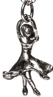
ECSEN Sterling silver dancing Eve on 17" silver necklace (+1" ext) $28