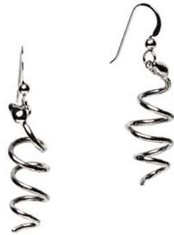
ECSSDE Sterling silver snake earrings (apx 1.5") $40