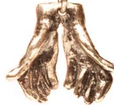
ECBRHN Bronze hands 17" necklace (+1" ext) $42