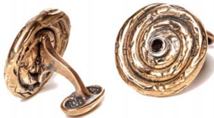
TLBRBSPCF Bronze branch cufflinks bezel set 3mm black spinel $52