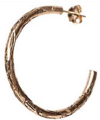
TLBRME Bronze medium branch earrings (apx 1.2") $34