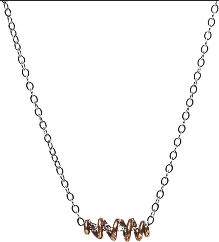
TLBRSSN Bronze wrap on 17" sterling silver chain necklace $34