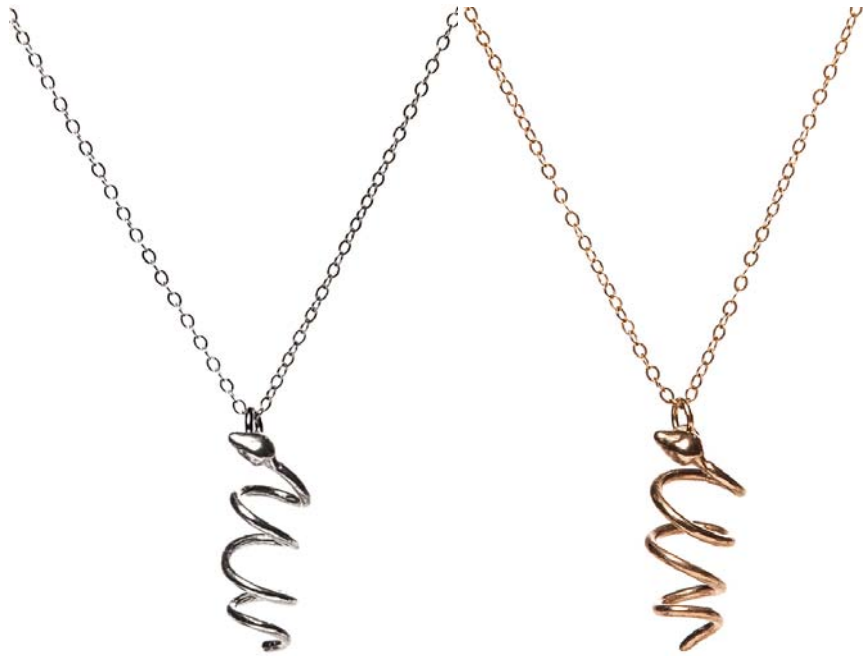
ECSSN Sterling silver snake on 17" silver chain necklace (+1" ext) $26