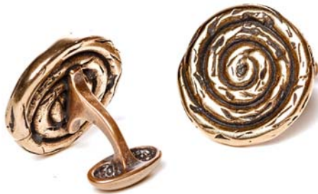
TLBRCF Bronze branch cufflinks $36