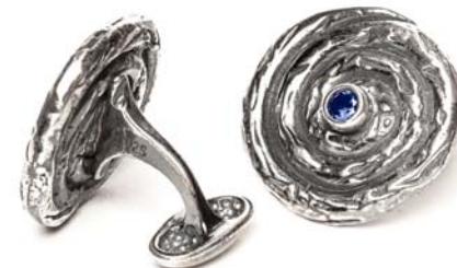
TLSSBSCF Sterling silver branch cufflinks bezel set 3mm labgrown blue sapphire $85