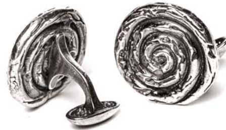
TLSSCF Sterling silver branch cufflinks $65