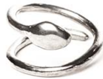
ECSSAR Sterling silver adjustable snake ring $30