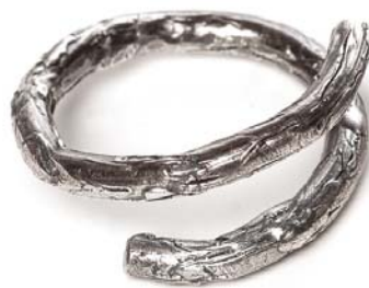
TLSSLR Sterling silver adjustable, stackable large branch ring $34