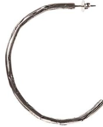
TLSSXLE Sterling silver XL branch earrings (apx 1.8") $44