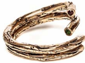
TLBRRSR Bronze adjustable, stackable branch ring with 1.8mm red sapphires $26