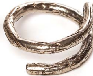
TLBRLR Bronze adjustable, stackable large branch ring $18